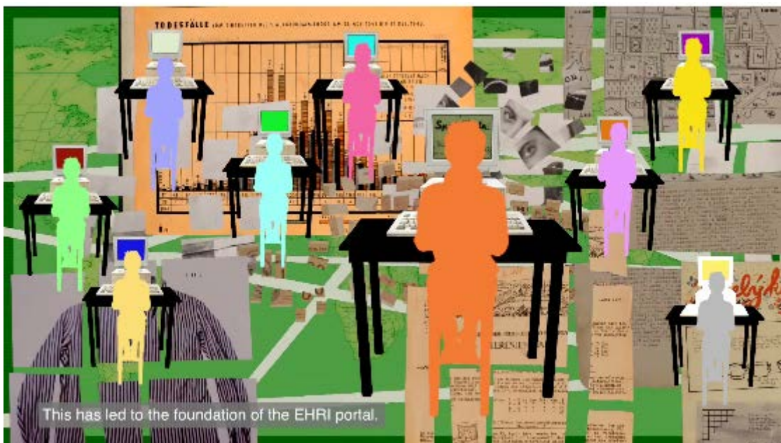
Figure 1: EHRI Portal Video screenshot

The aim of the video is to offer a short, concise and visually appealing introduction to the Portal, particularly focusing on the basic questions: “What is EHRI and what is the Portal?”; “Why do we need a Portal for Holocaust Sources?”; “What kind of information can I find in the Portal?”